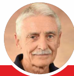
PROF. LELAND H. HARTWELL Nobel Laureate, Director of the Fred Hutchinson Cancer Research Center in Seattle, Washington, USA