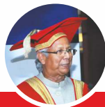
PROF. (DR.) MUHAMMAD YUNUS Nobel Laureate & Social Entrepreneur, Banker, Economist, and Civil Society Leader