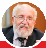
PROF. MICHEL MAYOR Swiss Astronomer and Nobel Laureate in Physics