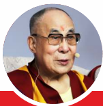
HIS HOLINESS THE 14TH DALAI LAMA A Buddhist Monk, Philosopher & Nobel Laureate