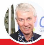
SIR RICHARD JOHN ROBERTS Nobel Laureate & Chief Scientific Officer at New England Biolabs in Ipswich, Massachusetts