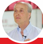
PROF. ROGER D. KORNBERG Nobel Laureate & American Biochemist & Professor of Structural Biology at Stanford University School of Medicine