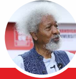
PROF. DR. WOLE SOYINKA World-renowned Writer, Poet & First African Nobel Laureate in the field of Literature