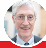
PROF. JOHN C. MATHER Nobel Laureate & Sr. Astrophysicist at NASA, Space Flight Center